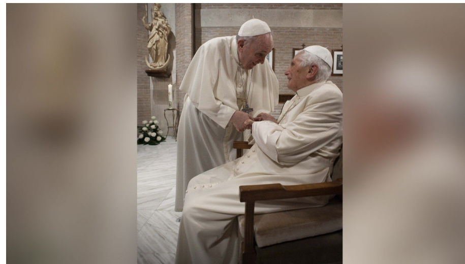
Pope Francis and Pope Emeritus Benedict XVI receive their first doses of the Covid-19 vaccine in the Vatican.