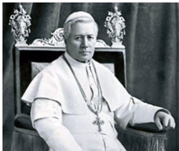
Friday - Pope St Pius X (1835 - 1914)

The Church is always suffering from corruption and always being renewed. If St Bernard, so often ill, could take a leading part in this renewal, what excuse do we have? Universalis