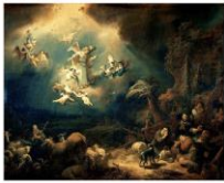
4 th SUNDAY OF ADVENT (23 rd / 24 th December):

23 rd December - 6 pm, Saturday-Vigil – Our Lady of Perpetual Succour and St. Cumin's, Morar